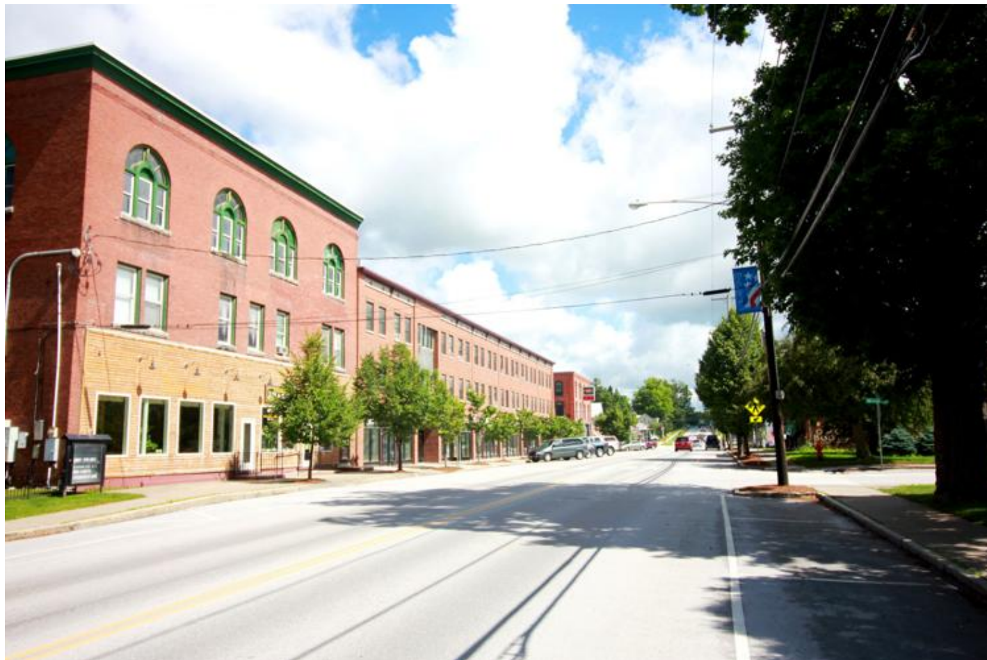
Downtown Enosburgh Falls.